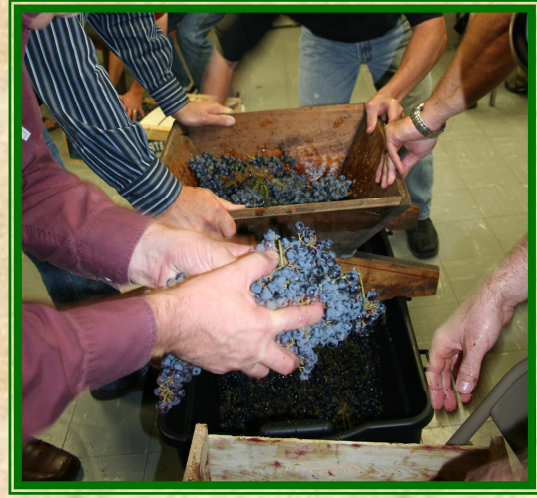
Wine Making at the Clubhouse - Come Join Us!

Italian Workmen's Club 914 Regent Street Madison, WI 53715