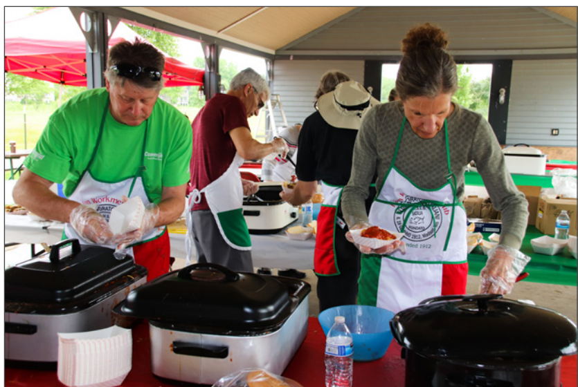
The Kitchen Crew Hard At Work

cold beer, wonderful music, interactive cultural exhibits and fun activities.