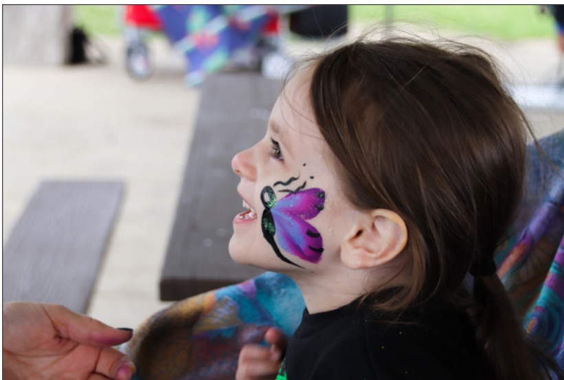
"I want a butterfly on my cheek please."