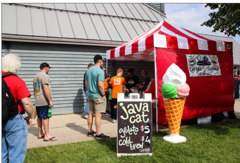
Java Cat Serves Up Gelato