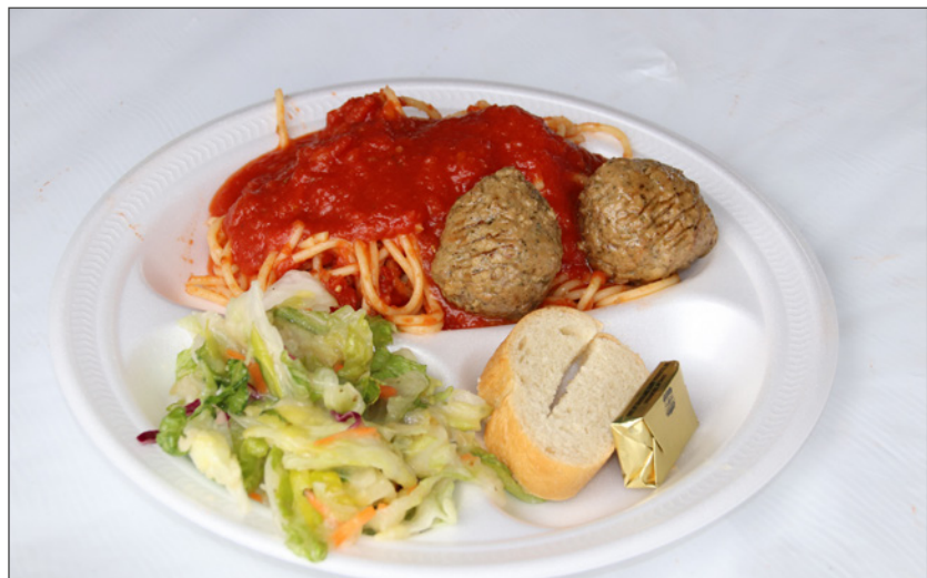
Pasta and Meatball Dinner