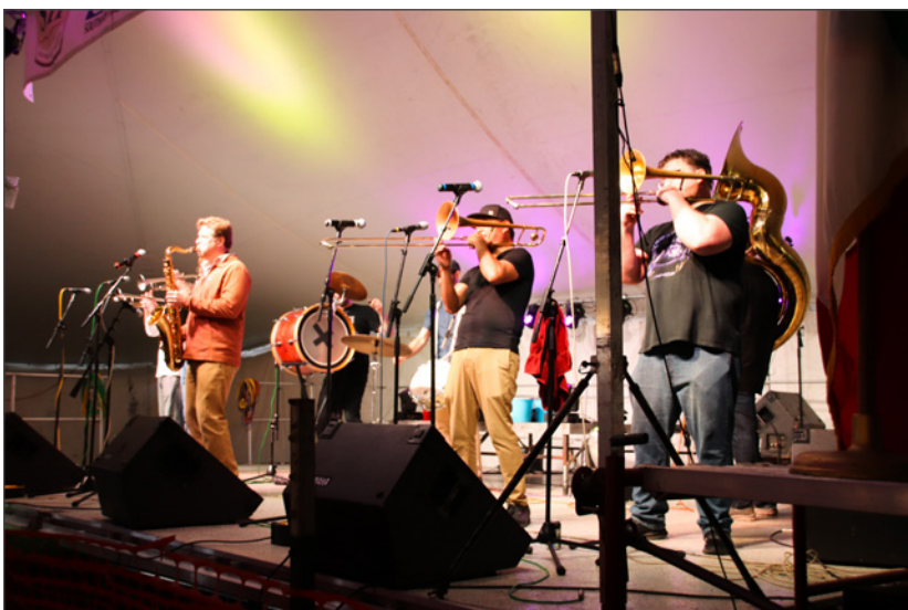
Mama Digdown's Brass Band Entertains

nage, post event tear down and on the spot problem solving.