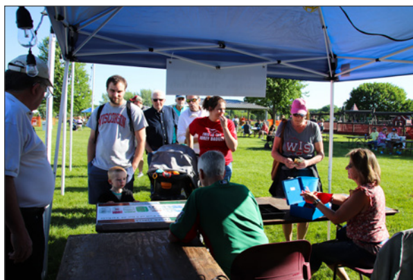
Beverage Ticket Sales