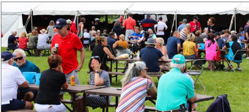
The Festa Crowd Settles In