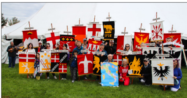
Flags Of Italy Presentation