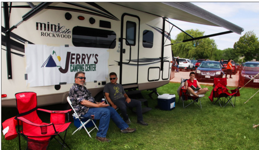
Finance Trailer