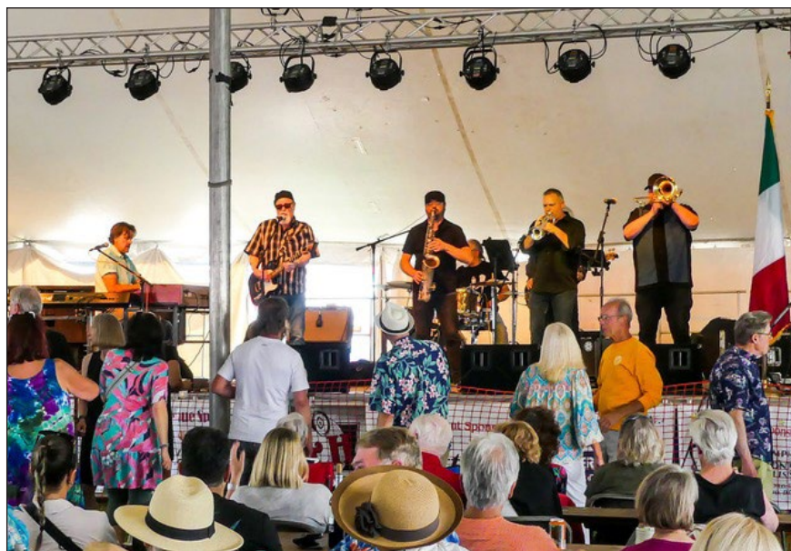
Rare Element performs on music stage