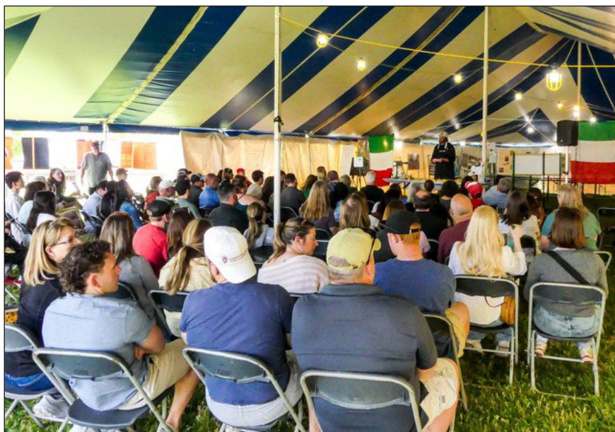
Cooking demonstration packs the culture tent