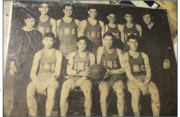
Methodist Church basketball team