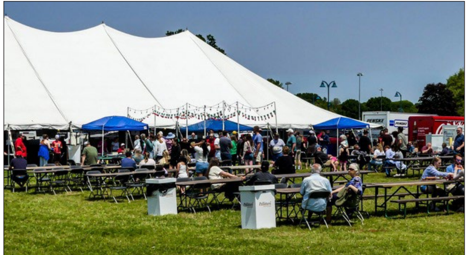
Festa: Great food, fine wine and sunshine