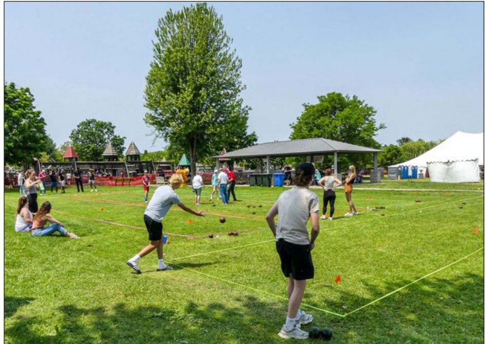
Photo: Bocce competition